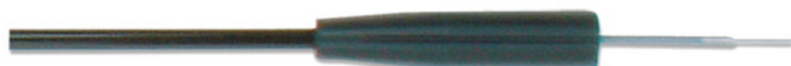
Stainless Steel Applicator